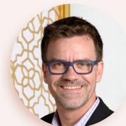
Stephen Russell College of Natural Sciences